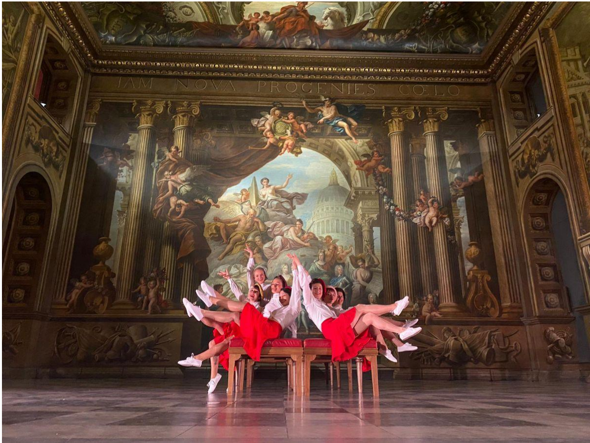
Painted Hall, Old Royal Naval College, Greenwich.